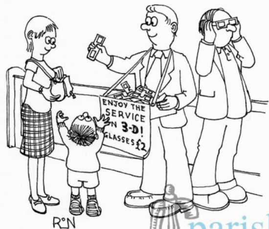
The treasurer still had a trick up his sleeve